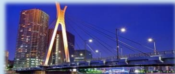
Chuo Ohashi Bridge

Stylish bridge designed by a French design company, Chuo Ohashi Bridge is a symbol of Chuo ward. The bridge was completed on the 26 th August 1993, same day than the well-known Rainbow Bridge in Odaiba.