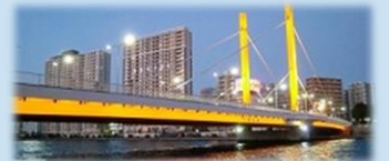
Shin Ohashi Bridge

Built in 1693, Shin Ohashi Bridge was one of the bridges that was spared by the Great Kanto Earthquake and allowed people to escape.