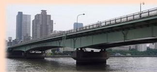
Tsukuda Ohashi Bridge

Built in 1964, it was the first bridge built over the Sumida River after the World War II. Tsukuda Bridge offers a spectacular panoramic view of skyscrapers in Tokyo.