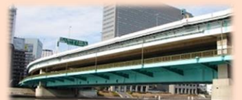
Sumida River Large Bridge

Double-decked bridge completed in 1970. It is carrying an expressway and general road over the river. Beautiful night view can be observed from the road.